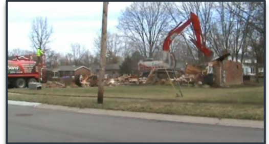
One of many residential structures in Fairfield that has been acquired and demolished

achieve their goal. The City has received two grants from the Pre-Disaster Mitigation grant program, and they were recently awarded Hazard Mitigation Grant Program (HMGP) funding to continue their efforts to reduce flood risk in Fairfield. The overall effort exhibited with this project has been a successful collaboration of all levels of government. Once completed, this land will comprise the third largest preservation area within the City, and it will be part of the City Parks System.