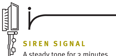
SIREN SIGNAL A steady tone for 3 minutes

Sirens could be activated for different types of events. Events could include tornadoes, flooding, chemical spills, or an emergency at the Davis-Besse Nuclear Power Station.