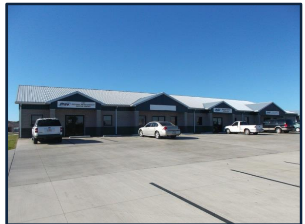
Jackson County Office Location