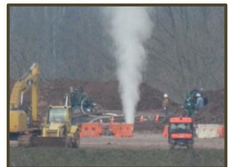
Monroe County Gas Release December, 2014

Ohio EMA will continue to provide support in 2015. Thank you all for a continued partnership in keeping Ohio safe.