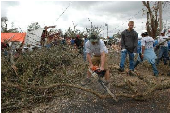
Lady Lake, FL (Feb. 3, 2007) - A volunteer works to clean up a tree felled by the tornadoes that hit central Florida last week.

(ATLANTA, Ga.) - The U.S. Department of Homeland Security's Federal Emergency Management Agency (FEMA) is on the ground in Florida, helping the state and its affected communities recover from tornadoes that struck Thursday night and Friday morning. President George Bush issued a disaster declaration on Saturday, February 3.