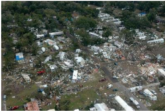
Lake County, FL (Feb. 3, 2007) - Tornadoes cut a swath through central Florida early Friday morning. FEMA has begun its initial response to the disaster.

(From FEMA News Release dated February 4 and 6, 2007)