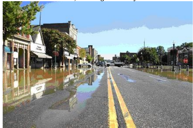
Marietta, Washington County

Ohio River flooding has occurred over an area extending from Columbiana County in the north to Gallia in the south. All rivers are now below flood stage. The forecast for today is sunny with the high in the 80's and is expected to remain so through Thursday. There is a chance for scattered showers on Friday and Saturday, but no heavy precipitation is expected.